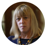
Jody Williams Nobel Peace Prize Laureate