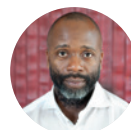
Theaster Gates Founder Rebuild Foundation