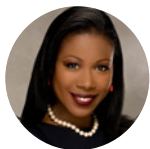
Isabel Wilkerson Author, Caste: The Origins of Our Discontents