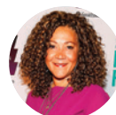
Michele Norris Founding Director The Race Card Project